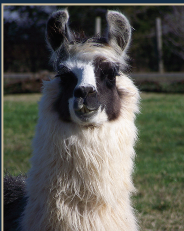
Chilean Sweet Iris (Bred-F)