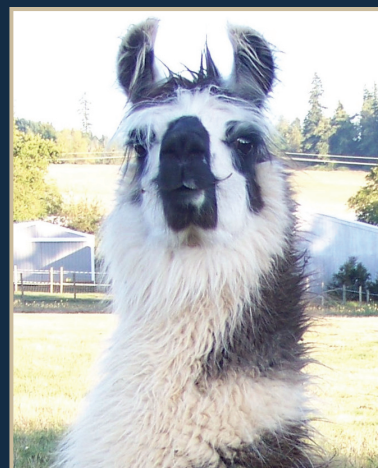
RLL Destinye (Bred-F)

The Tallmon Family • 30645 S.E. Currin Road • Estacada, Oregon 97023