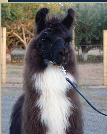
HOLR London's Encore (M)

Also, please check out the following consignments we are offering at the Cascade Llama Sale being held April 24, 2010!