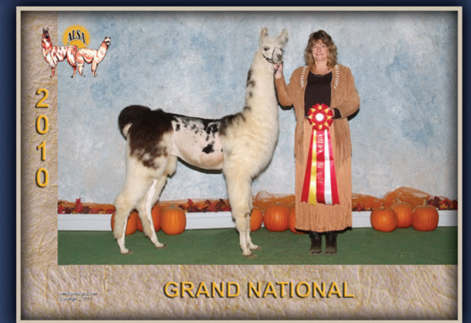
HOLR Apollo: 2010 ALSA Grand Nationals • Reserve Champion of his class of Medium Wool Juvenile Males -- his first time shown!