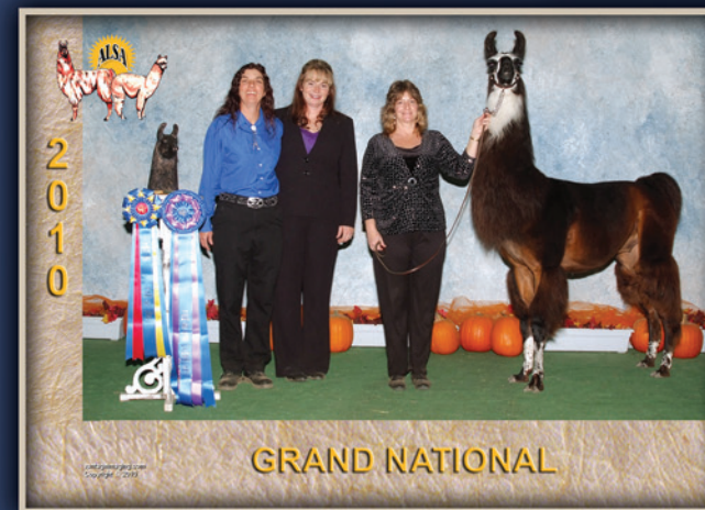
Jorjio: ALSA Non-Breeder Elite Champion • 2010 ALSA Grand National Driving and Non-Breeder Champion • 2010 ALSA Grand National Versatility Non-Breeder Reserve Champion