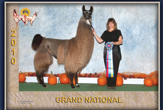
Silver Light: 2010 ALSA Grand Nationals • Champion of her class of Heavy Wool 2-Year-Old Females