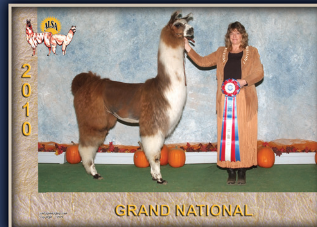
HOLR Antonio: 2010 ALSA Grand Nationals • Top 10 (4th) Medium Wool Yearling Males